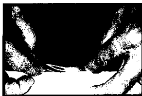
Fold 1 inch Tab Over Filament