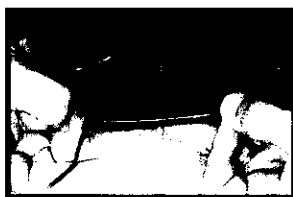
Apply Reinforcement Filament