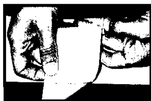
Apply Leaving 1" Tab Beyond Edge