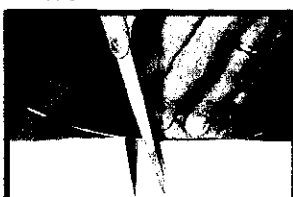
Cut Filament to Width of Patch