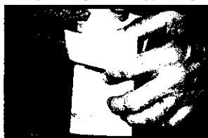
Apply to Back Side