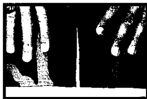
Tear on Edge