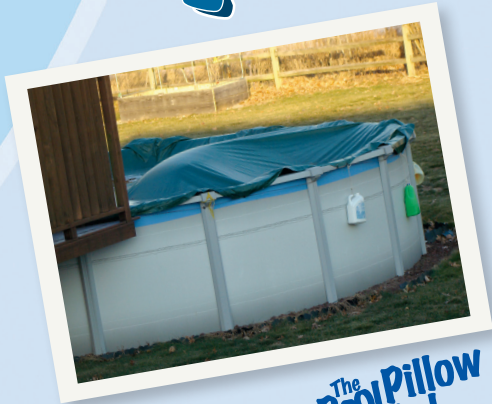
Without The Pool Pillow Pal